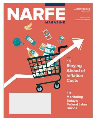
Figure 4: NARFE Magazine