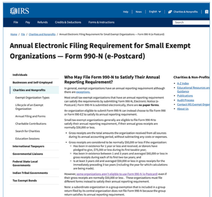
Figure 2: Exempt Organizations Select Check (990-N filer information)