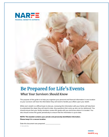
Figure 3: F-100 Be Prepared for Life Events