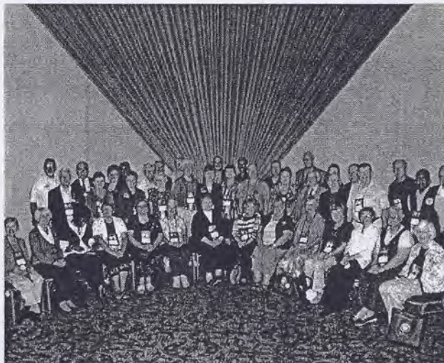
Virginia Delegation at the 2008 NARFE National Convention, Louisville, Kentucky

I'm anticipating a wonderful convention in May and am looking forward to meeting with many old friends and meeting new ones. The Convention Committee has put together a very exciting program that I hope to be able to report on in the next VFC Notes as the President of the Virginia Federation of Chapters.