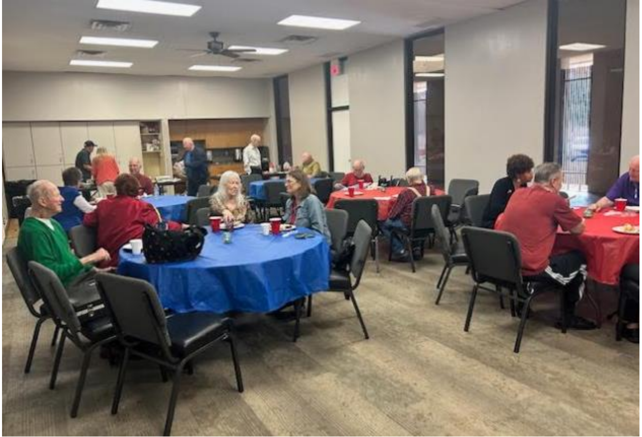
December 2024 Holiday Party and the installation of officers