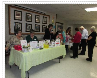
Attendees at the NARFE Districts 12 & 15 Convention in San Antonio

attended. Nineteen of the attendees were from our chapter. It was a very