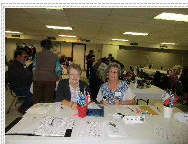
Sign in Table at NARFE Districts 12 & 15 Convention In San Antonio

February: Chapter meeting was canceled for the month due to Chapter 1594 hosting Districts 12 and 15 Convention the 20th of February. Forty-four members from all chapters in the districts