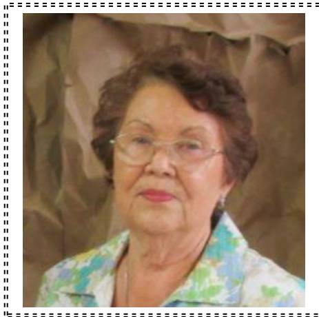
sitting on the other side of the officer's table at the meetings.