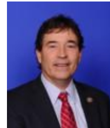
Troy Balderson 12th District R.