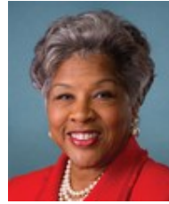
Joyce Beatty 3rd District R.