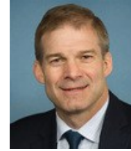
Jim Jordan 4th District R.