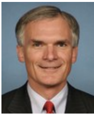
Robert Latta 5th District R.