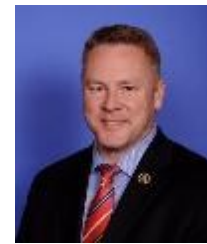
Warren Davidson 8th District R.