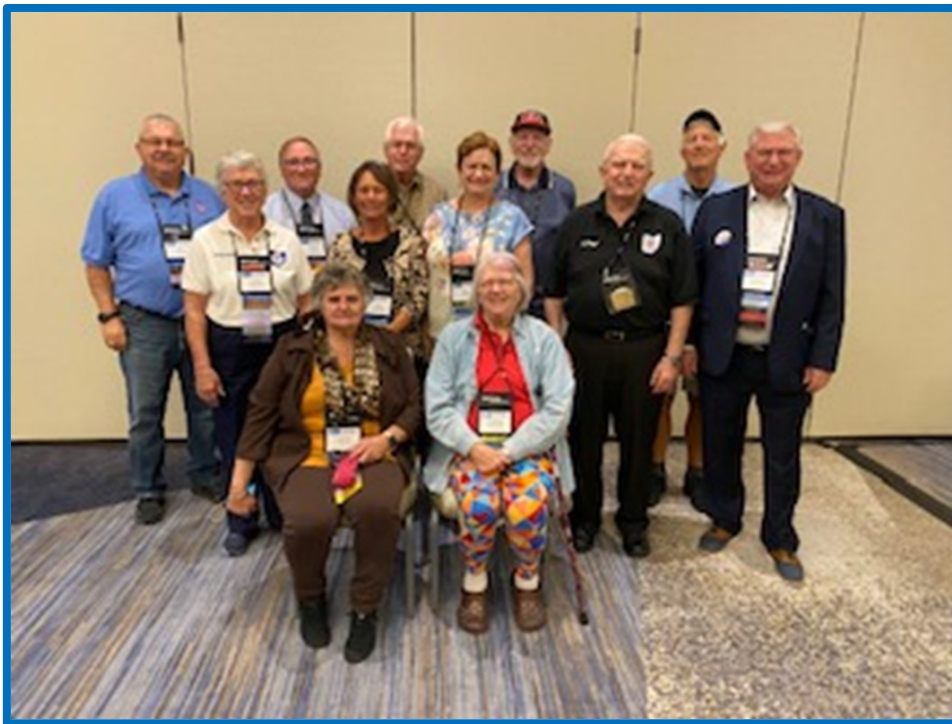
FEDCON24 OHIO FEDERATION ATTENDEES