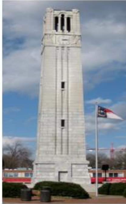
Bell Tower, NC State University

The Raleigh Chapter of the National Active and Retired Federal Employees Association was established in 1953 and was one of the founding chapters of the North Carolina Federation of Chapters.