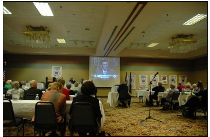
General Session: DVD Greetings US Senator Kent Conrad