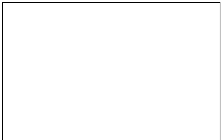
Installation 2010\ 2011 Federation Officers