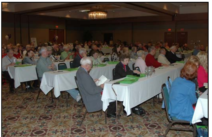
General Session Attendees