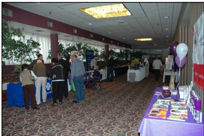
Exhibit and Break Area