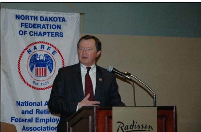
General Session: Greetings US Representative Earl Pomeroy