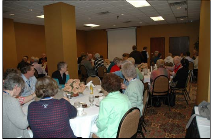
Historic Luncheon Attendees