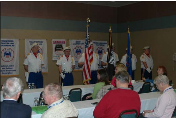
Presentation of Colors AMVET Post #9 Color Guard