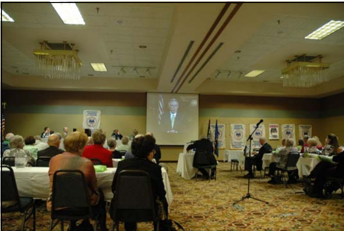
General Session: DVD Greetings US Senator Byron Dorgan