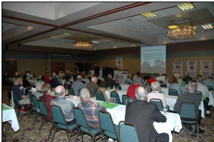
Membership Recruiting Panel Discussion