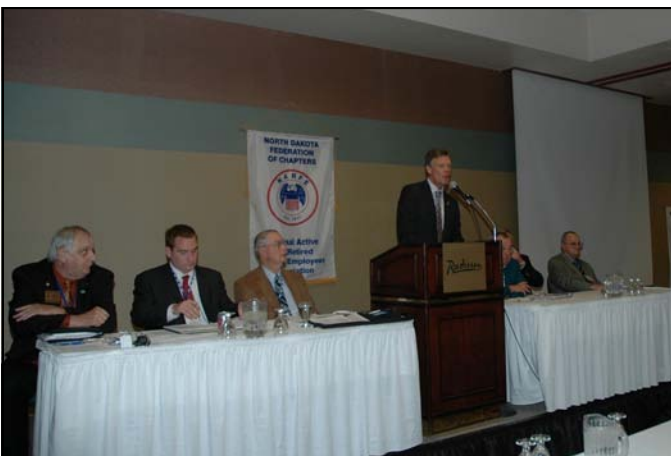
General Session: Welcome Bismarck Mayor Warford (at podium)