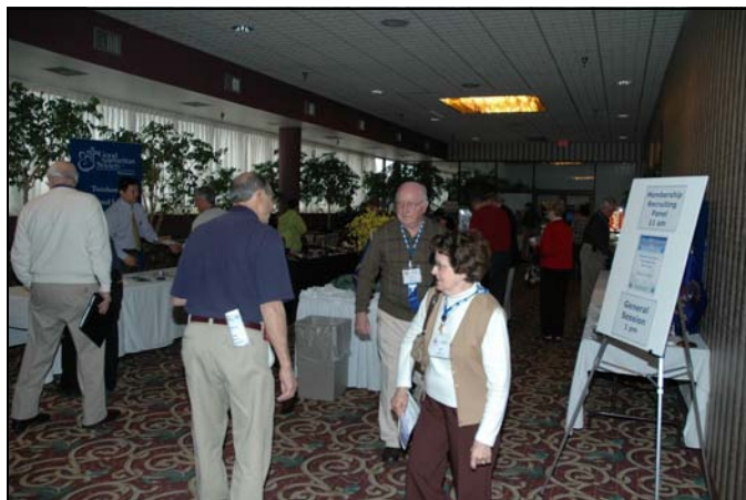
Attendees Greet One Another