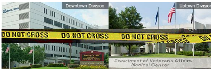
No federal nurses to care for Veterans

NARFE's photo set warns of no airport security officers on hand to screen travelers; jammed traffic in a snowstorm, as drivers got no advance warning from the National Weather Service; and veterans hospitals that lack nurses to attend the sick. This, the association says, is what American life would look like without federal employees.