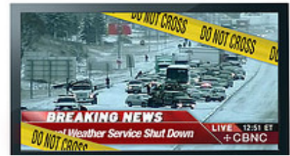
No National Weather Service meteorologists

Chapter 101 has 338 dues paying members on the roles but we have phone numbers for only 234 of those members and e-mail addresses for only 99 of the members. Please help to close the gap. Remember NARFE is the only organization that exist to protect your earned benefits. NARFE has many tools in this effort, with one of the most important being the ability to inform you quickly about what is going on and giving you easy access to the tools needed to forward your concerns to