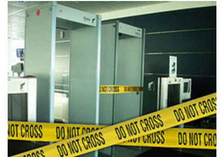
No TSA officers

The group warns that, even if the House and Senate do reach a compromise on government spending, other proposals from House Republicans -- to furlough federal workers, reduce compensation and shrink the size of the workforce through attrition -- would weaken the government and lead to similar scenarios.